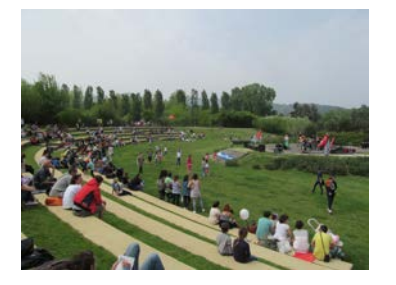
Increase and continue outdoor community events, more designated locations