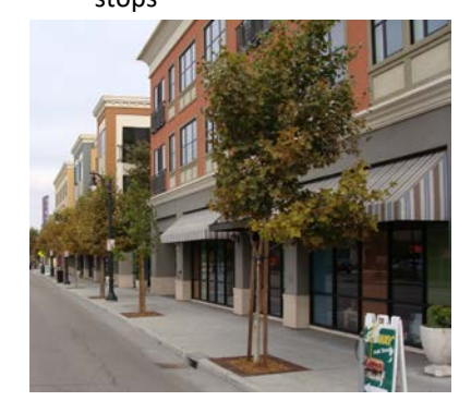
Additional and more affordable housing, including above retail