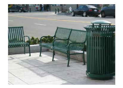
More benches in general, but especially near bus stops