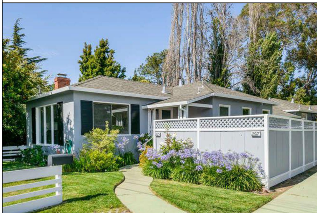
2615 Garfield Street, - 2 UNITS

Allowing duplexes triplexes and fourplexes in some single-family neighborhoods can help address the housing crisis of both availability and affordability on the Peninsula. This will have significant environmental benefits, as it will reduce the long-distance commuting and traffic congestion that arises from workers needing to commute from long distances, even from the Central Valley.