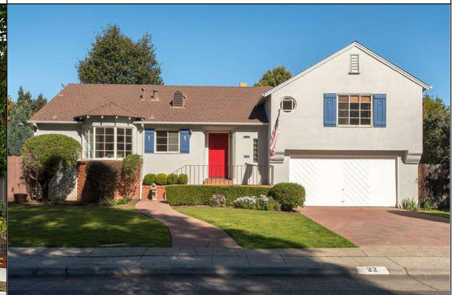
22 De Sable Road, San Mateo – 2 UNITS