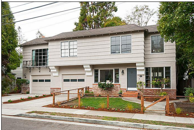
313 Elm Street, San Mateo – 3 UNITS