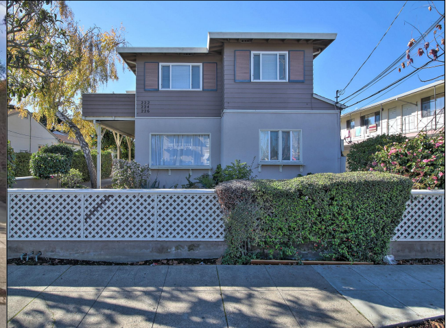
222 South Idaho Street, San Mateo – 3 UNITS