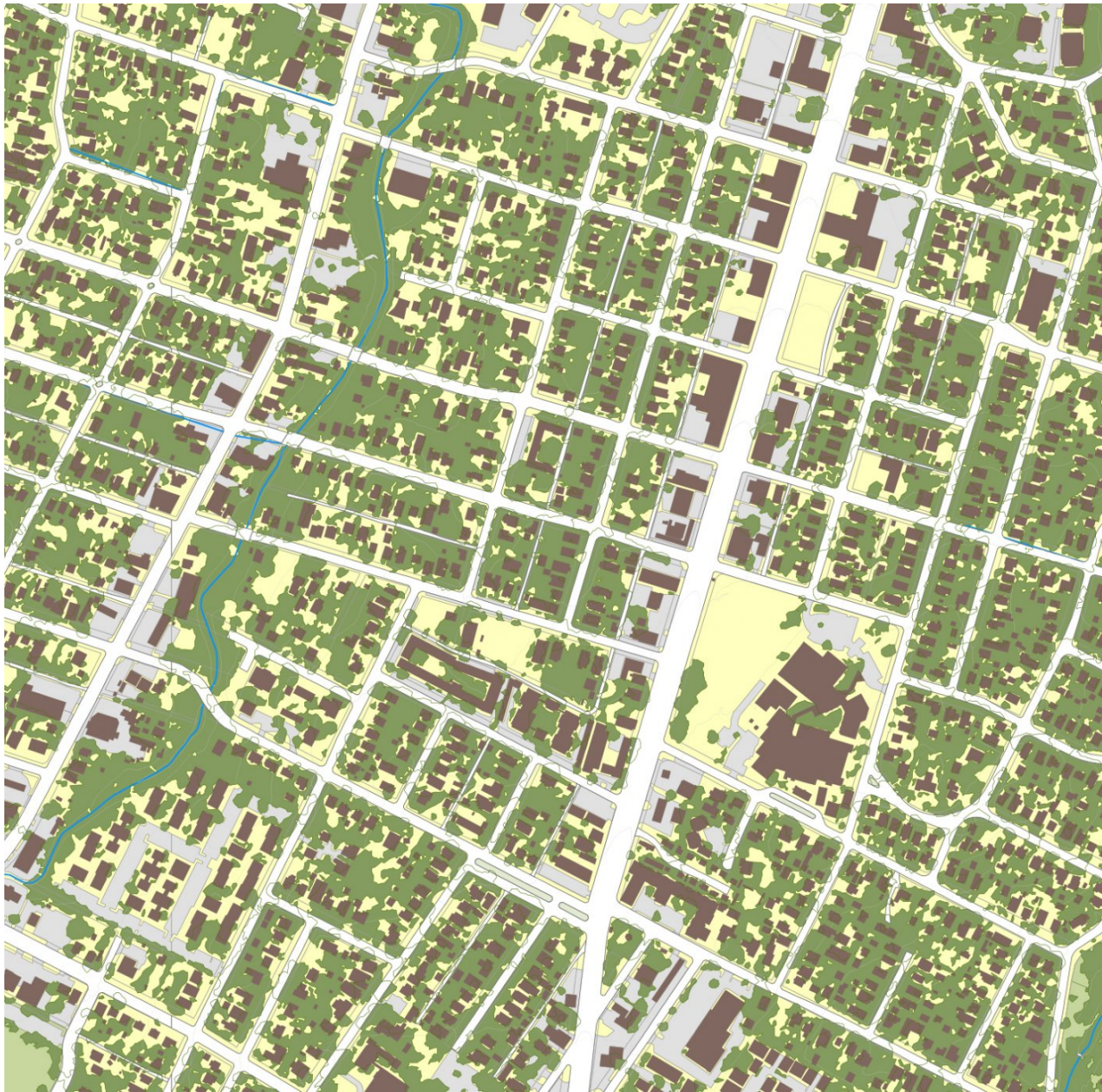
Development patterns in walkable urban neighborhoods make walking and biking convenient and support robust public transit. (Bouldin Creek neighborhood in Austin, TX.)