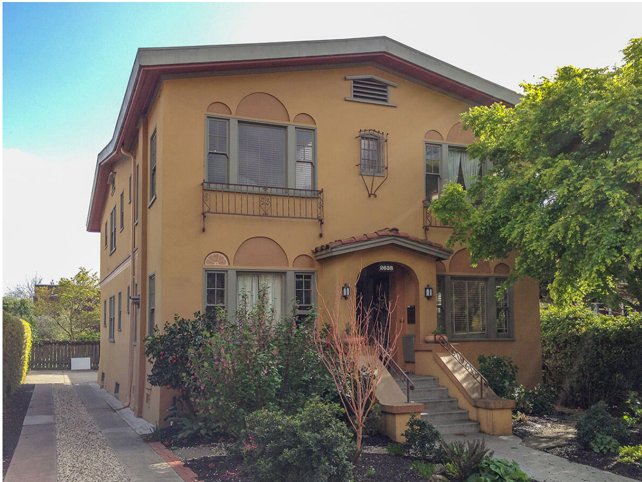
Missing Middle housing types generally have a similar size footprint to detached single-family homes.

These housing types typically have small- to medium-sized footprints, with a body width, depth and height no larger than a detached single-family home. This allows a range of Missing Middle types—with varying densities but compatible forms—to be blended into a neighborhood, encouraging a mix of socioeconomic households and making these types a good tool for compatible infill.