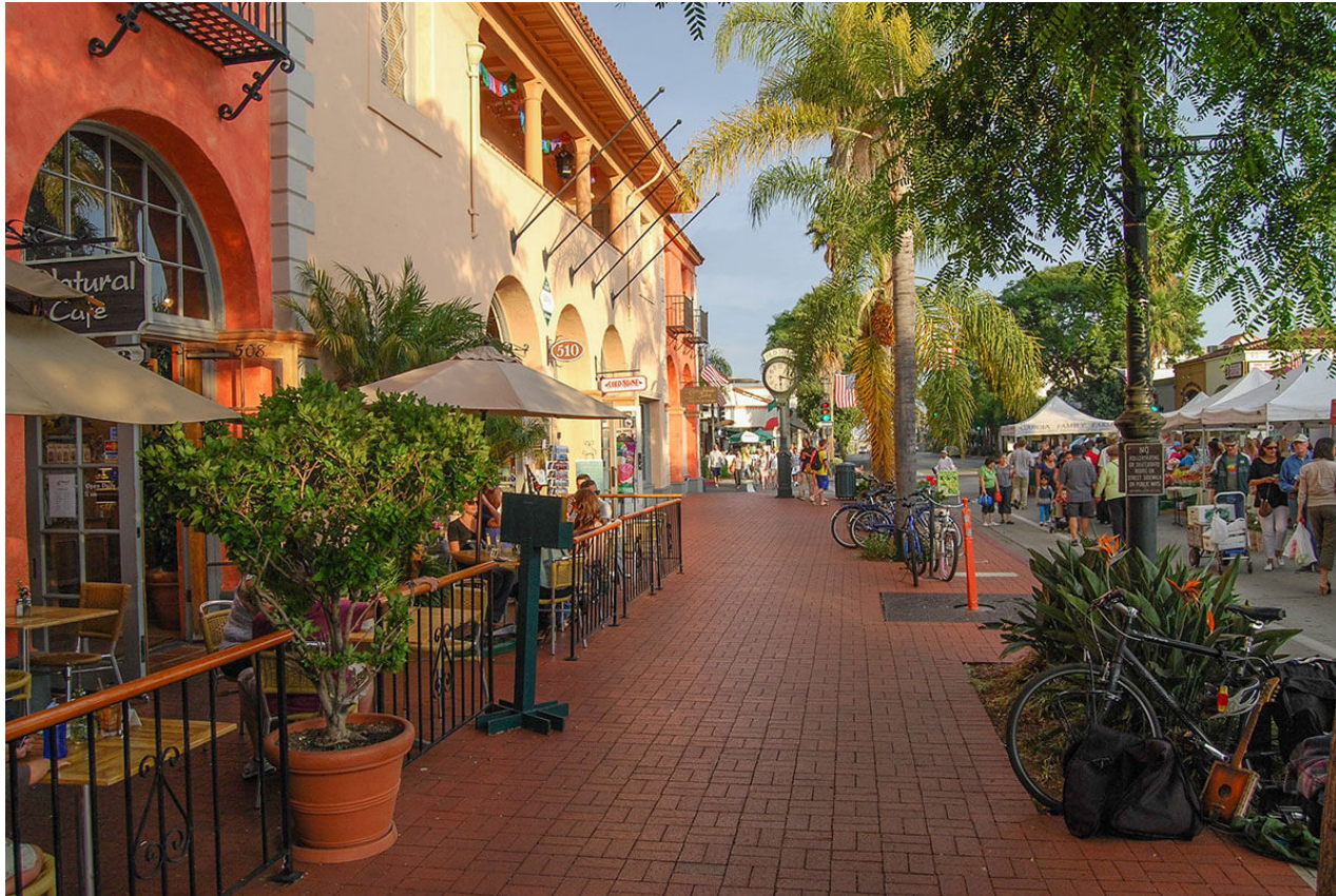
Missing Middle housing types help to create walkable communities.

This is an important aspect in particular considering the growing market of single-person households (nearly 30% of all households) that want to be part of a community.