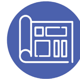
Address Historic Preservation Holistically