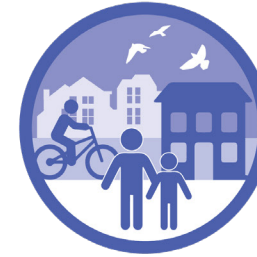
Enhance San Mateo's Neighborhood Fabric & Quality of Life