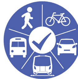
Encourage All Ways to Travel Around the City