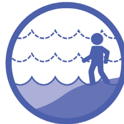
Initiate a Comprehensive Sea Level Rise Strategy