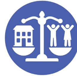
Balance Growth & Change