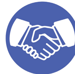
Focus on Equity for All Residents