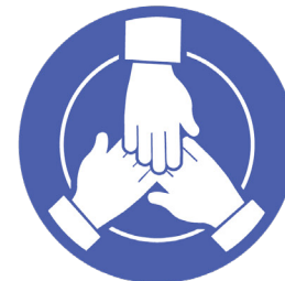
Strengthen Community Outreach