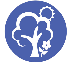
Preserve Nature as the Foundation of the City