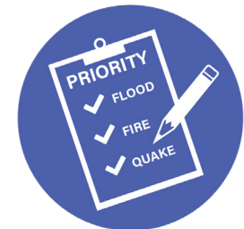
Improve Community Safety Planning & Awareness