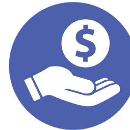
Support the Local Economy